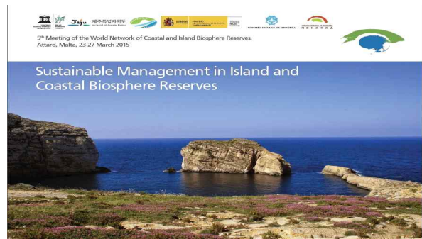
(Cover page of the 5 th Meeting Casebook)

http://wnicbr.jeju.go.kr/index.php/eng/resources/sourcebook